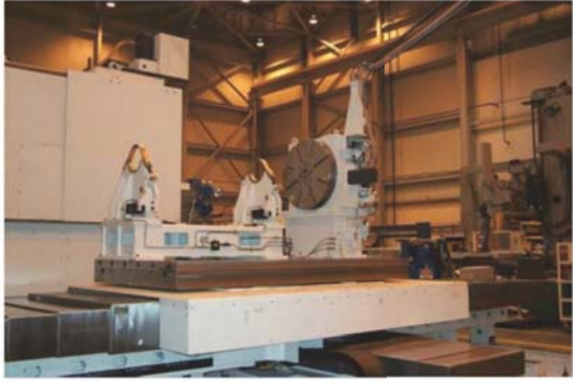
Large vertical rotary table with part supports