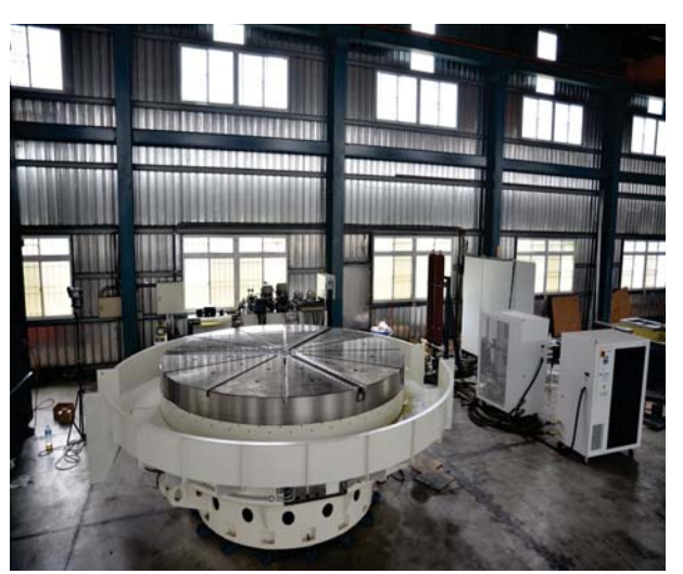
Large horizontal with chillers