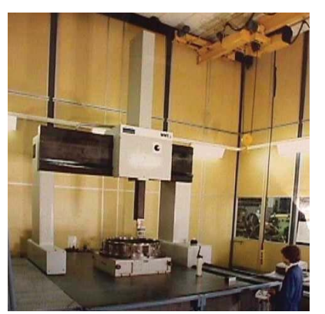
CMM inspection rotary table