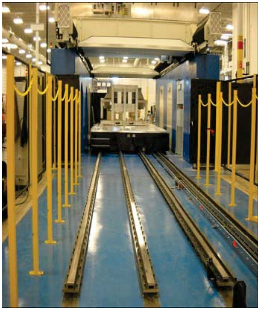
Large 4m x 7m pallet system