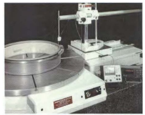
100mm diameter air bearing rotary table used for measuring applications