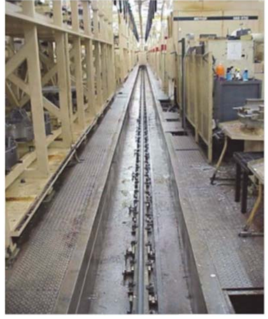
Pallet shuttle & storage system