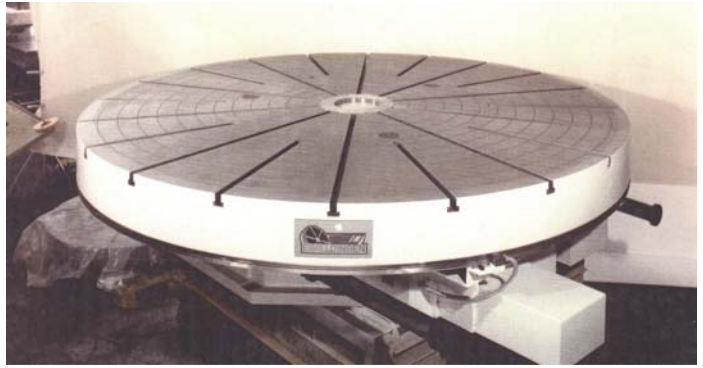
Air bearing inspection table