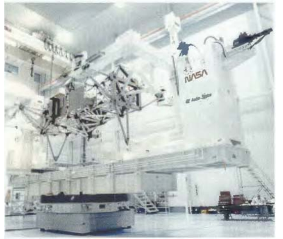
4,000mm diameter air bearing rotary table used for satellite assembly

Rusach International is established as a major supplier for inspection and metrology rotary tables . Incorporating past engineering & design success, our air bearing tables stand above the competition. Designed specifically for metrology, testing and inspection applications, the air bearing range combines high accuracy, rigidity and extremely large loading capacities to meet customer demands.