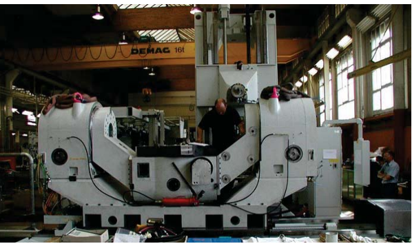
Large rotary tilting table