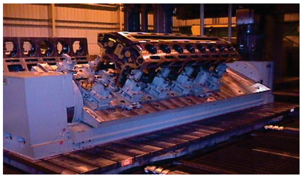
Tilting table for diesel engine head machining