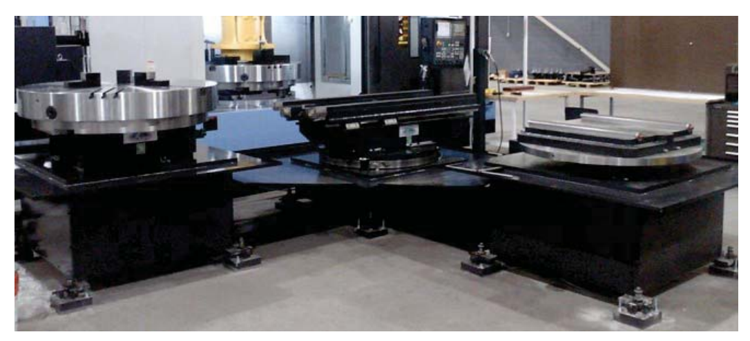
Traditional style pallet changer

Rusach International has been manufacturing pallet automation systems for the new machine and retrofit market since 1976. Pallet automation systems have become a vital part of automating the machining process. We can design a system that shuttles pallets from multiple loading stations into a single machine or moves pallets between multiple machines, loading stations, storage sites and inspection equipment. These systems are custom designed, so you only pay for what you want. Expansion capabilities can also be planned into the system for future needs.