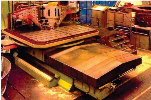
Traveling rotary table